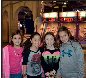
Make sure you take some time to visit the Iroquois Springs website and check out all of the great pictures from the reunion.