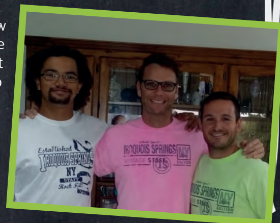
Ski staff both past and present showing off there IS pride